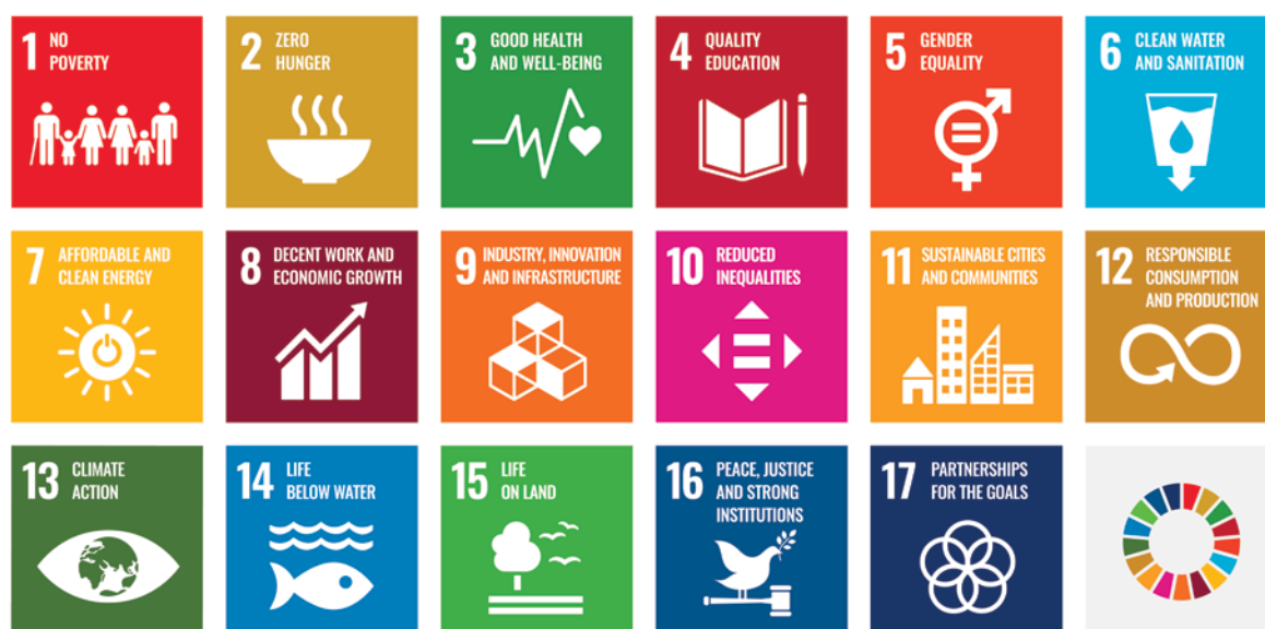
Exhibit 6: United Nations Sustainable Development Goals: A roadmap for change

The 2030 Agenda for Sustainable Development, adopted by all United Nations Member States in 2015, provides a shared blueprint for peace and prosperity for people and the planet, now and into the future. At its heart are the 17 Sustainable Development Goals (SDGs).